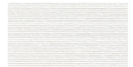
grooved 600x1200x10.7mm / 800x1800x10mm