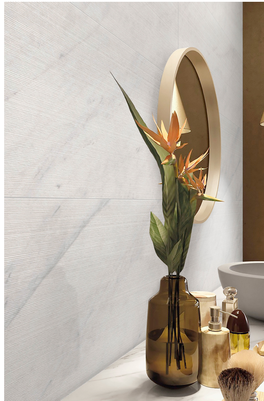
B62V2141GH-10 Grooved 600x1200x10.7mm 24"x48"