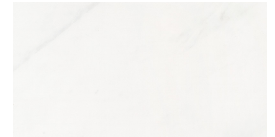
honed 600x1200x10.7mm / 800x800x10mm