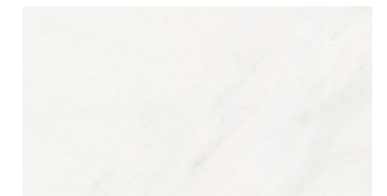
Light mold CUSTOMIZED