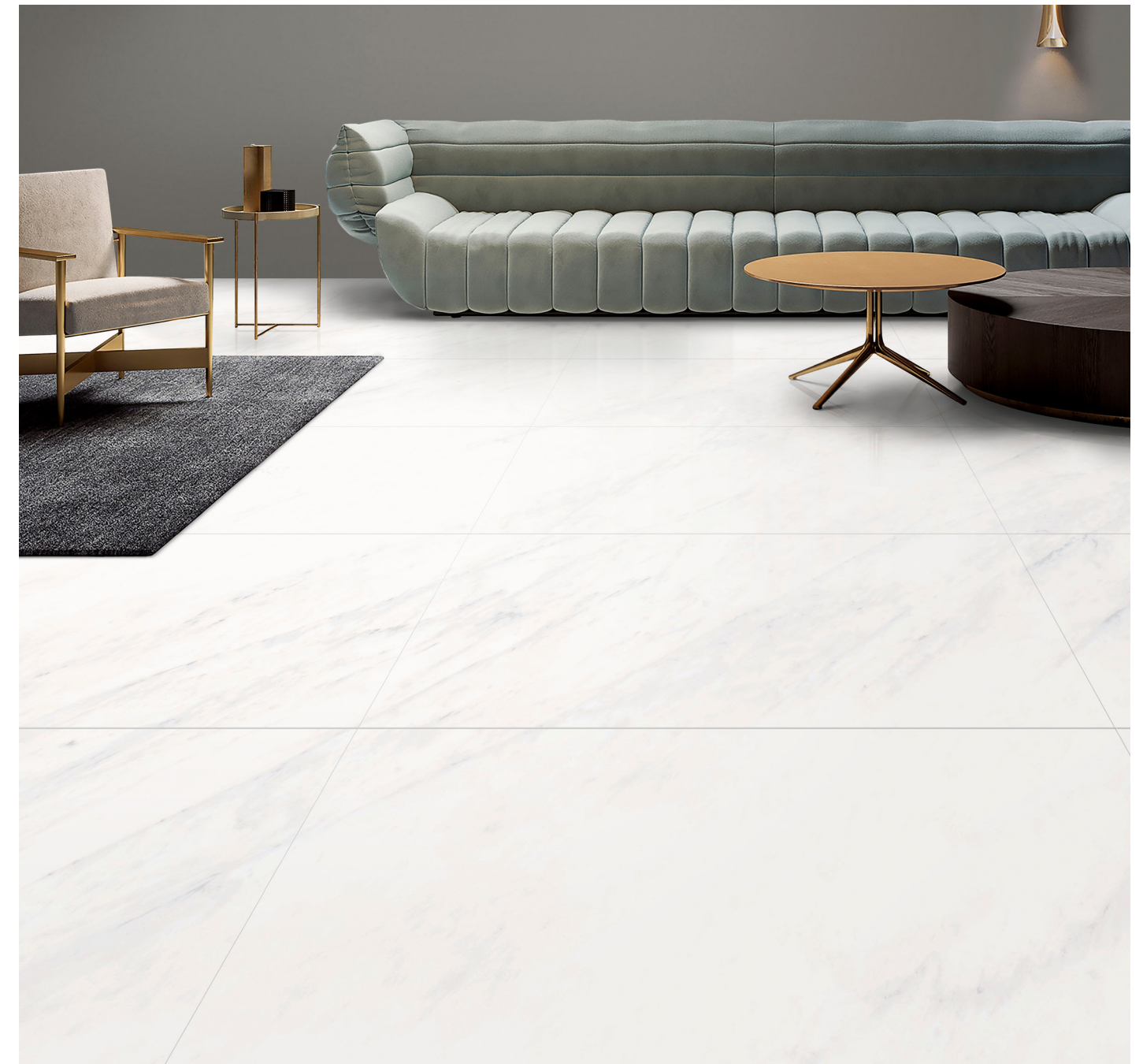
B62L2141G-10 Honed 600x1200x10.7mm 24"x48"